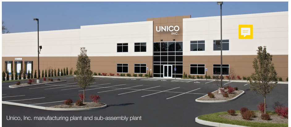
Unico, Inc. manufacturing plant and sub-assembly plant

Unico, Inc. is the leader in S mall Duct High Velocity (SDHV) heating and cooling systems and other high-end HVAC systems. The company manufactures all of its products in St. Louis, Missouri, with over 125,000 square feet of modern manufacturing space. The company is well known for extensive use in older, architecturally unique homes and buildings as well as elite, high-end custom homes. The company is family owned and operated and is available throughout the United States and Canada, and in over 28 countries around the world.