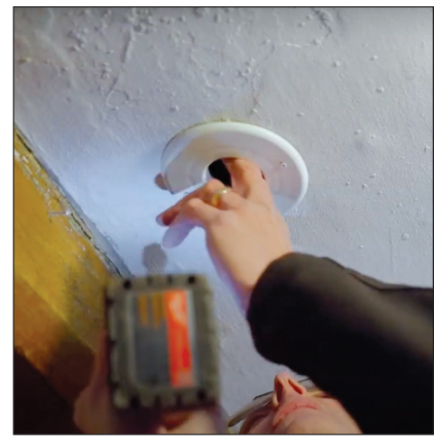
Small, round outlets blend in with the original plaster ceiling.