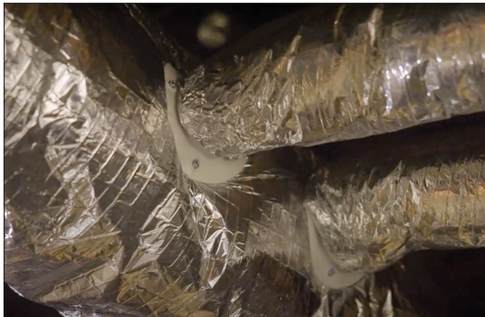
Flexible supply tubing branches off from the main duct.