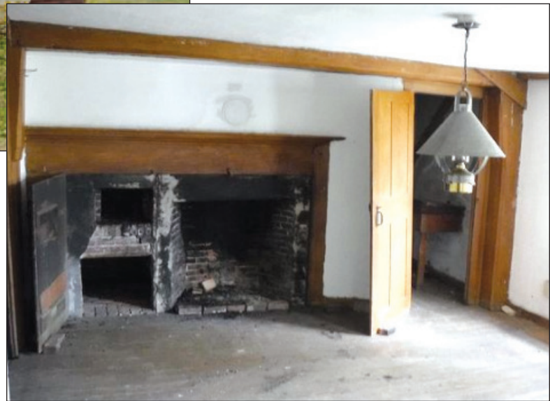
17th century version of "central heating."