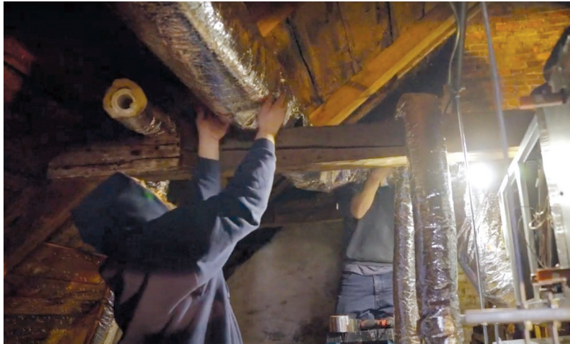
Installers situate the compact Unico System main duct.

Williams University, has over thirty years of experience in preserving and restoring historic structures. He and his team were given the daunting task of updating the home for modern living expectations while preserving as much of the home's original design and finishing as possible.