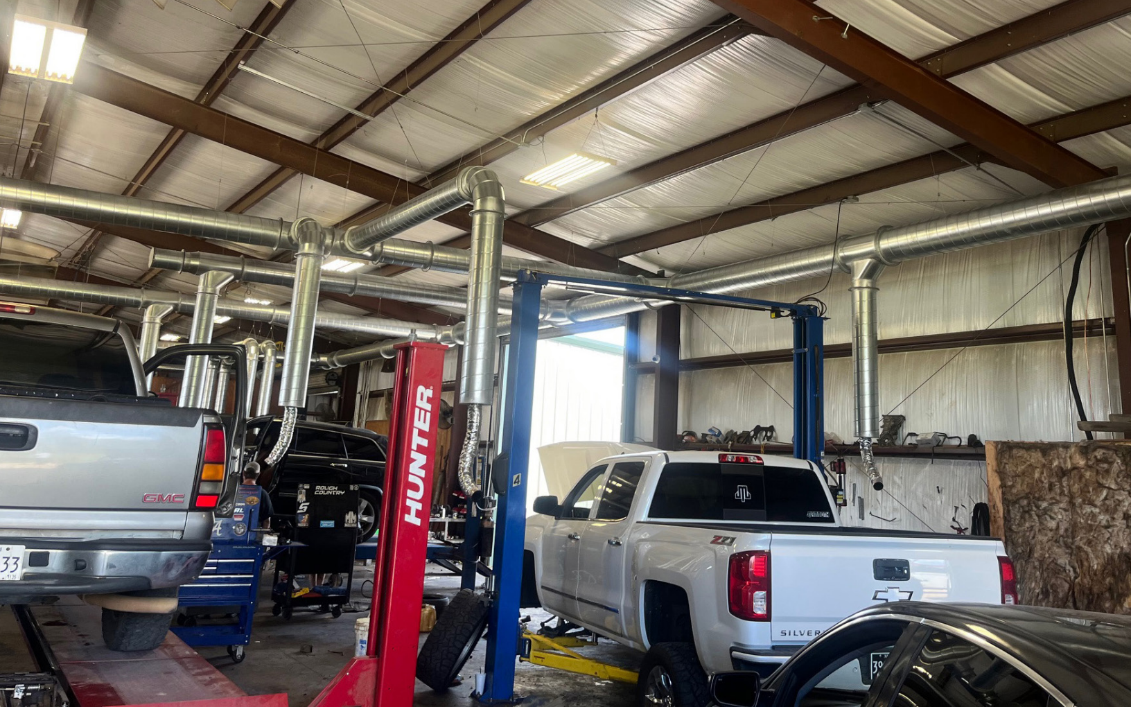
Unico Spot Cooling uses flexible tubing to deliver cool air to the mechanics at their workstations rather than inefficiently trying to condition the entire space.